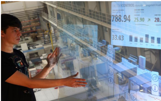
Image: All data of resources needed, such as compressed air, water, electrical energy, and machines and process data come together at the factory level in the „Control Center“. Scientists can visualize the information in real time on a dashboard and can thus design processes to save energy and raw materials. The transparent glass monitors are reminiscent of “holodecks” and can be controlled by means of gestures.

Image: The energy values of machines and equipments are to be captured in a production management system and linked to planning and operating data. This information flows into an energy-sensitive control system which is used by management personnel to optimize resource flows and material flows centrally through coordinated control.