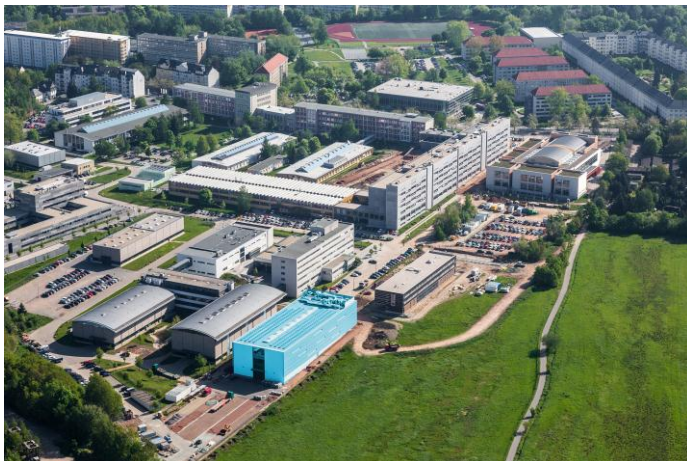
Image: The Fraunhofer IWU is developing its skills in the area of energy and resource efficiency at the E3-Research Factory Resource-efficient Production on the Campus E3 Production in Chemnitz.

Image: Construction work on the 1,640-square-meter "E3-Research Factory Resource-efficient Production" started in June 2011. This investment in the future was funded with 20 million euros from the European Union, the German Federal Government, and the State of Saxony.